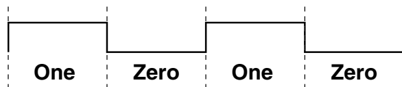
Figure 2: Serial Data Stream

A serial bit stream will interpret a '1' as a high voltage and a '0' as a low voltage. Some systems can have this inverted, but we will focus only on this method for the sake of simplicity. The concept is the same in either method. The receiver will then look for the rising edge of the first bit, wait \frac{1}{2} bit time to get to the center of the bit, then wait 1 bit time to sample each bit in its center. It will monitor the voltage level of each sample and interpret a high voltage as a '1' and a low voltage as a '0'.