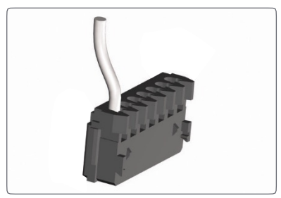
Unstripped wire inserted into MT housing.