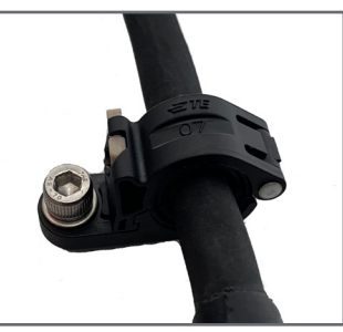
2. Install the harness with no tools or hardware.