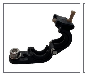
1. Mount the TE P-Clamp onto the structure.