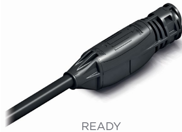
READY (fully closed)

Note: for detailed instructions, check Application Specification 114-133104