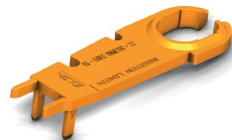
SOLARLOK delatch tool 2342988-1