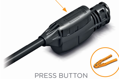
PRESS BUTTON (terminate cable)