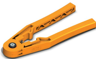
SOLARLOK hand tool 2341979-1