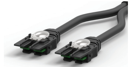
Intel Omni-Path Internal Faceplate-to-Processor (IFP) Plug - mates to IFT connector