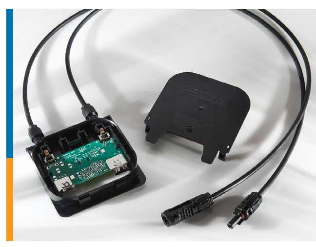
*Junction box is supplied with no printed circuit board.

The SOLARLOK Medium Smart Junction Box enables the integration of a Printed Circuit Board into the solution. The enclosure (junction box itself with no PCB*) is TUV and UL approved. Special clips allow you to quickly and reliably connect your PCB to the solar panel foils.