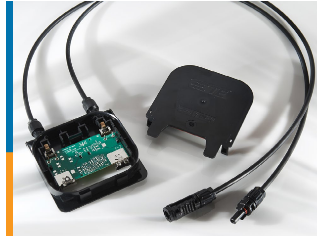
*Junction box is supplied with no printed circuit board.

The SOLARLOK PCB enclosure smart junction box enables the integration of a Printed Circuit Board into the solution. The enclosure (junction box itself with no PCB) is TUV/IEC and UL approved. Special clips allow you to quickly and reliably connect your PCB to the solar panel foils.