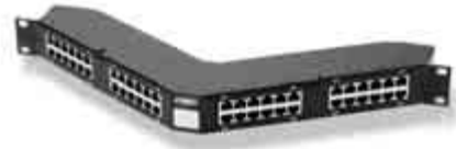
48-Port Angled Patch Panel Loaded