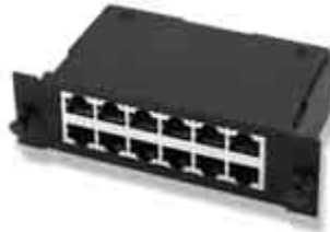
12-Port Cassette Front