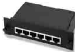
6-Port Cassette Front