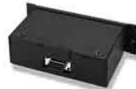
6-Port, 12-Port Cassette Back