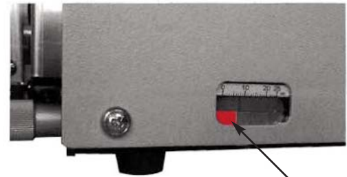
Partial Strip Indicator