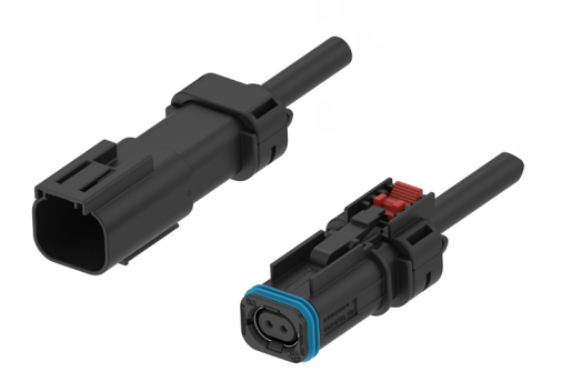
Male-to-Female Cable Assembly