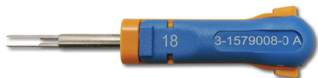
Tool in ready mode with retracted protective cover.