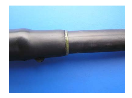
Allow to stand for 2 hrs before any aggressive handling