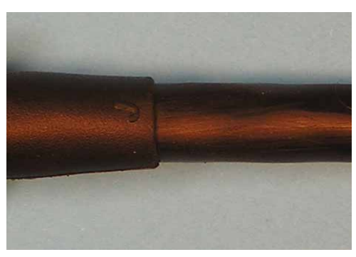
NOT ACCEPTABLE insufficient adhesive flow /180