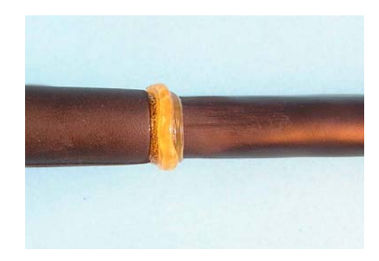
NOT ACCEPTABLE Excess adhesive flow /42, /86

NOT ACCEPTABLE Insufficient adhesive flow /42, /86