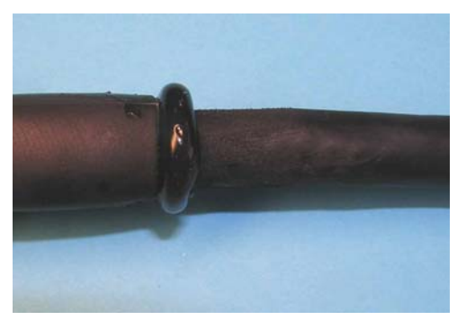
NOT ACCEPTABLE Excess adhesive flow /180