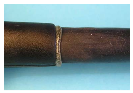
ACCEPTABLE /42, /86