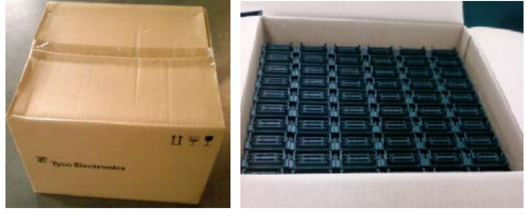
© 2011 Tyco Electronics Corporation Harrisburg, PA All International Rights Reserved Class 1

No products damaged, CTN is good with its appearance.