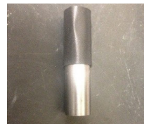
CORRECT ID PLUG GAGE KEEPS TUBING ROUND