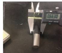
CORRECT OD PLUG GAGE KEEPS TUBING FROM BEING SQUEEZED