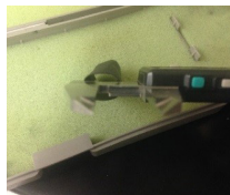
INCORRECT ID TUBING IS STRETCHED

When the tubing is expanded it becomes a lighter color. Black can become grey, red can turn more of a pink color, etc. What this means is that the color as received may not be the final color after it is recovered. This is not a defect, as color is judged on the recovered tubing, not the as received (or fully expanded) tubing. A sample should be cut, fully recovered and allowed to cool to properly evaluate the color.